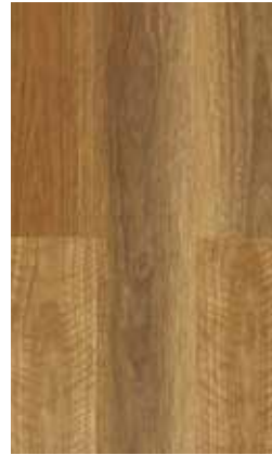
NSW Spotted Gum