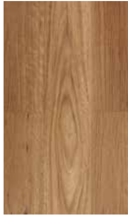
New England Blackbutt