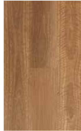
QLD Spotted Gum