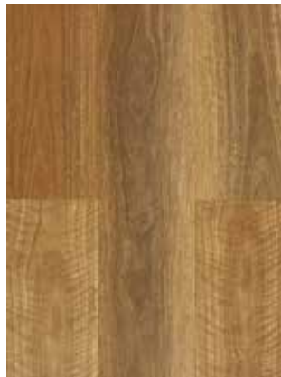
• Spotted Gum