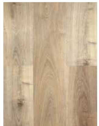
✓ Staten Island