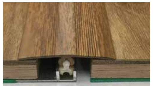
Expansion / Transition