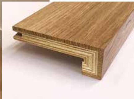
T&amp;G Stair Nosing

If stairs are involved in your project it is wise to spend time discussing this matter prior to purchase. These images are for illustrative purposes only.