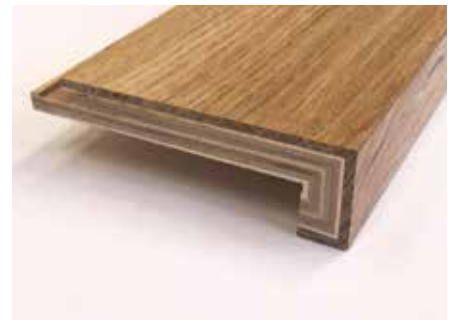
Click Stair Nosing